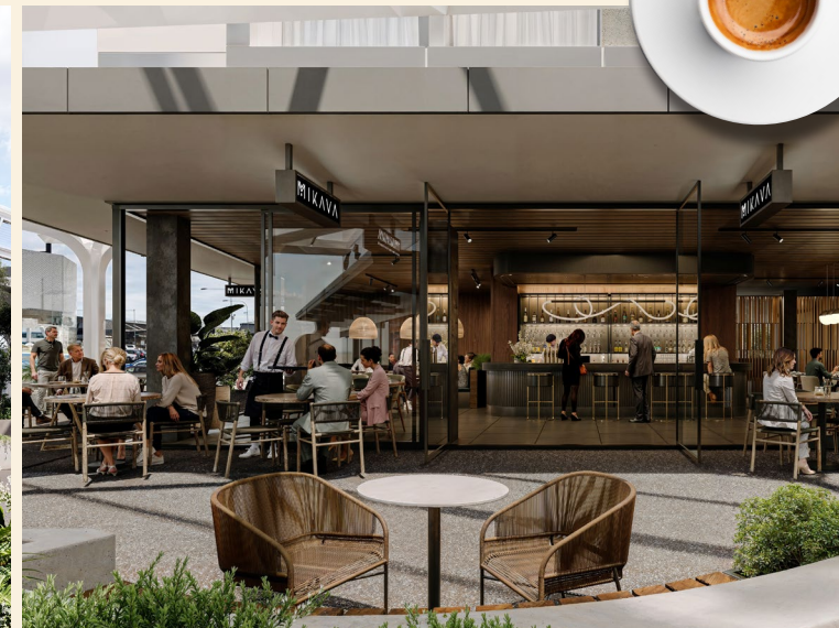
Artist Impression of the new restaurant at the entrance of Highbrook Crossing