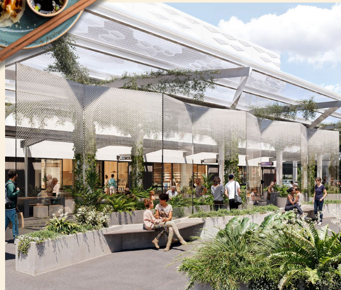
Artist Impression of the greenhouse-style glass canopy