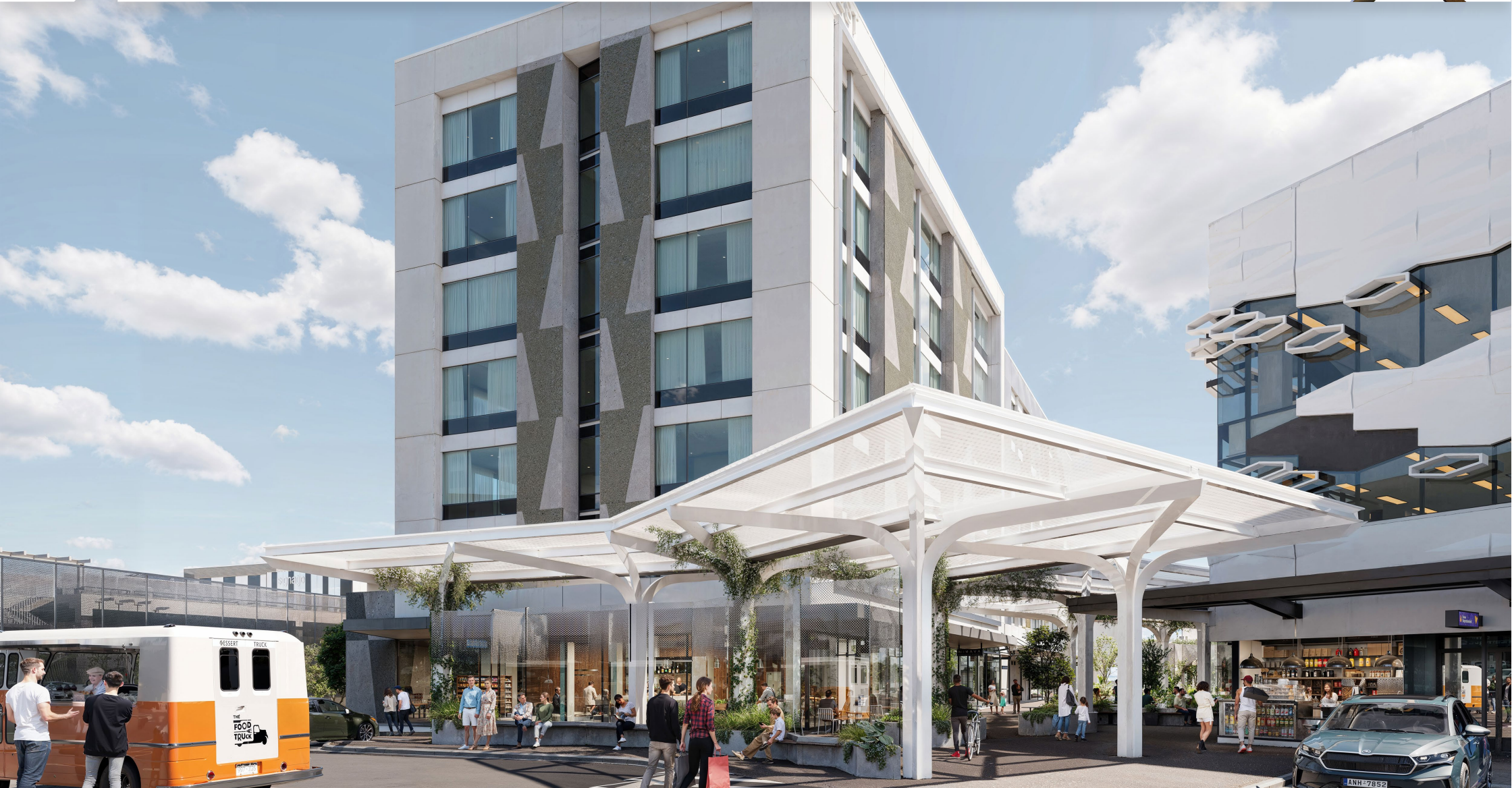
An extended canopy and welcoming entrance into Highbrook Crossing, allowing natural light in but shelter from wind and rain.