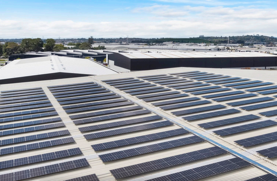
▲ PMA Global, Business Parade North, solar panels installed on their existing building.