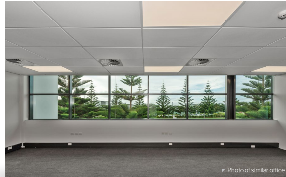
Photo of similar office