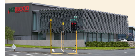
▲ Artist impression of the new NZ Blood Facility on the corner of Highbrook Drive and El Kobar Drive.

Two new warehouses are underway at the end of Business Parade North, and expected to complete mid-2023. Both facilities are already committed – Viscount FCC , an innovator in reusable packaging for the produce industry, and a confidential customer.