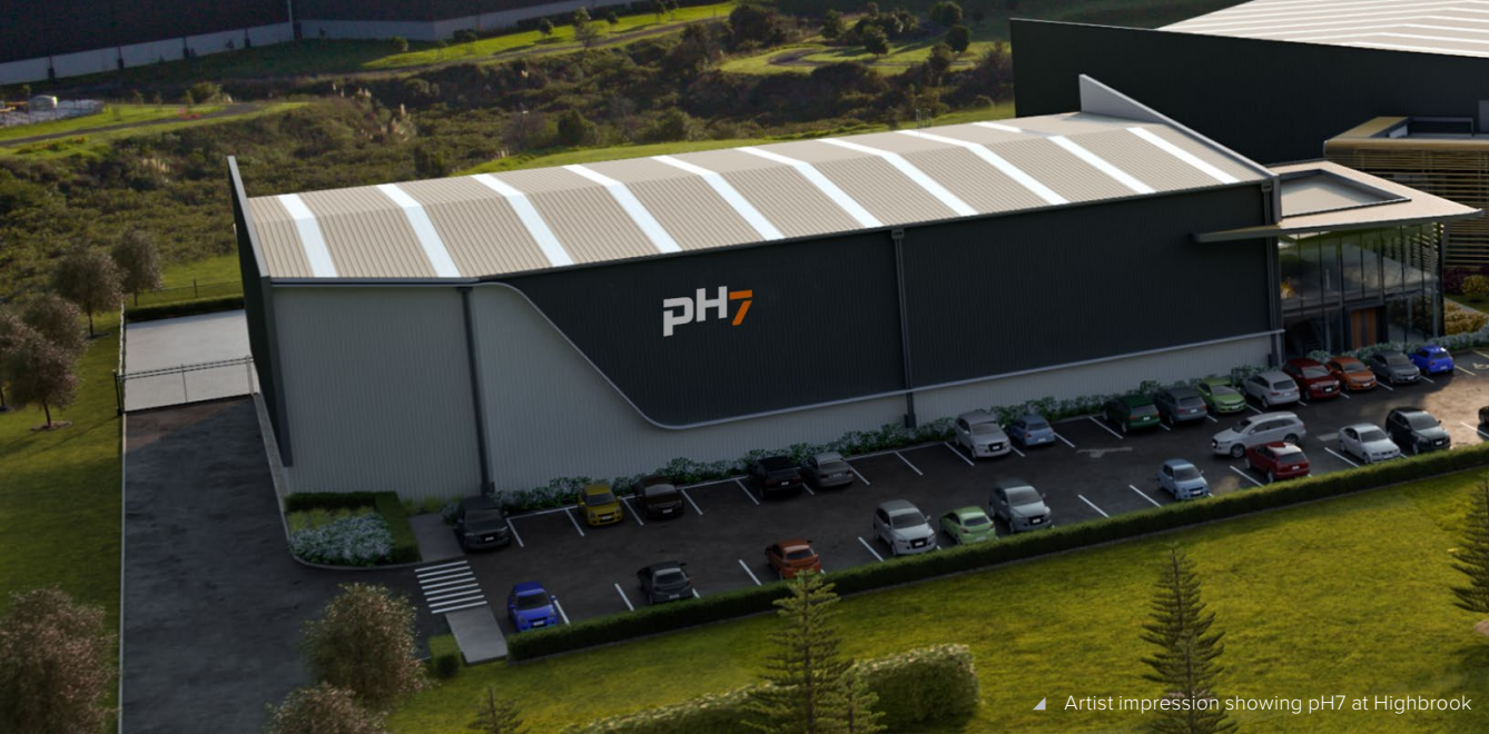
▲ Artist impression showing pH7 at Highbrook